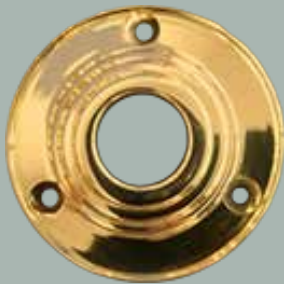
PB = Polished Brass