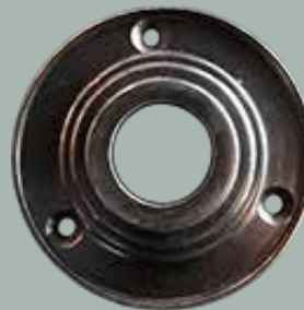
10B = Oil Rubbed Bronze