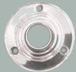
PN = Polished Brass

Please Note: The Classic Collection escutcheon spec sheets are for information only.