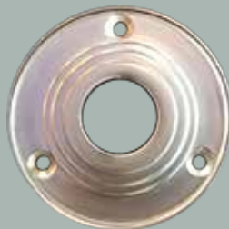
BN = Buff Nickel