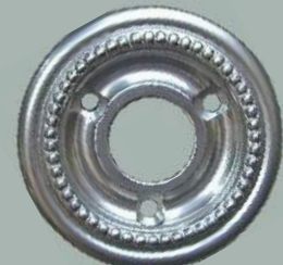
PB = Polished Brass