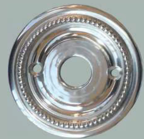
PB = Polished Brass